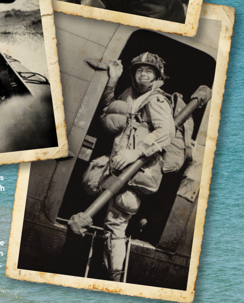
Paratrooper of the 101st Airborne Division prior to D-Day.